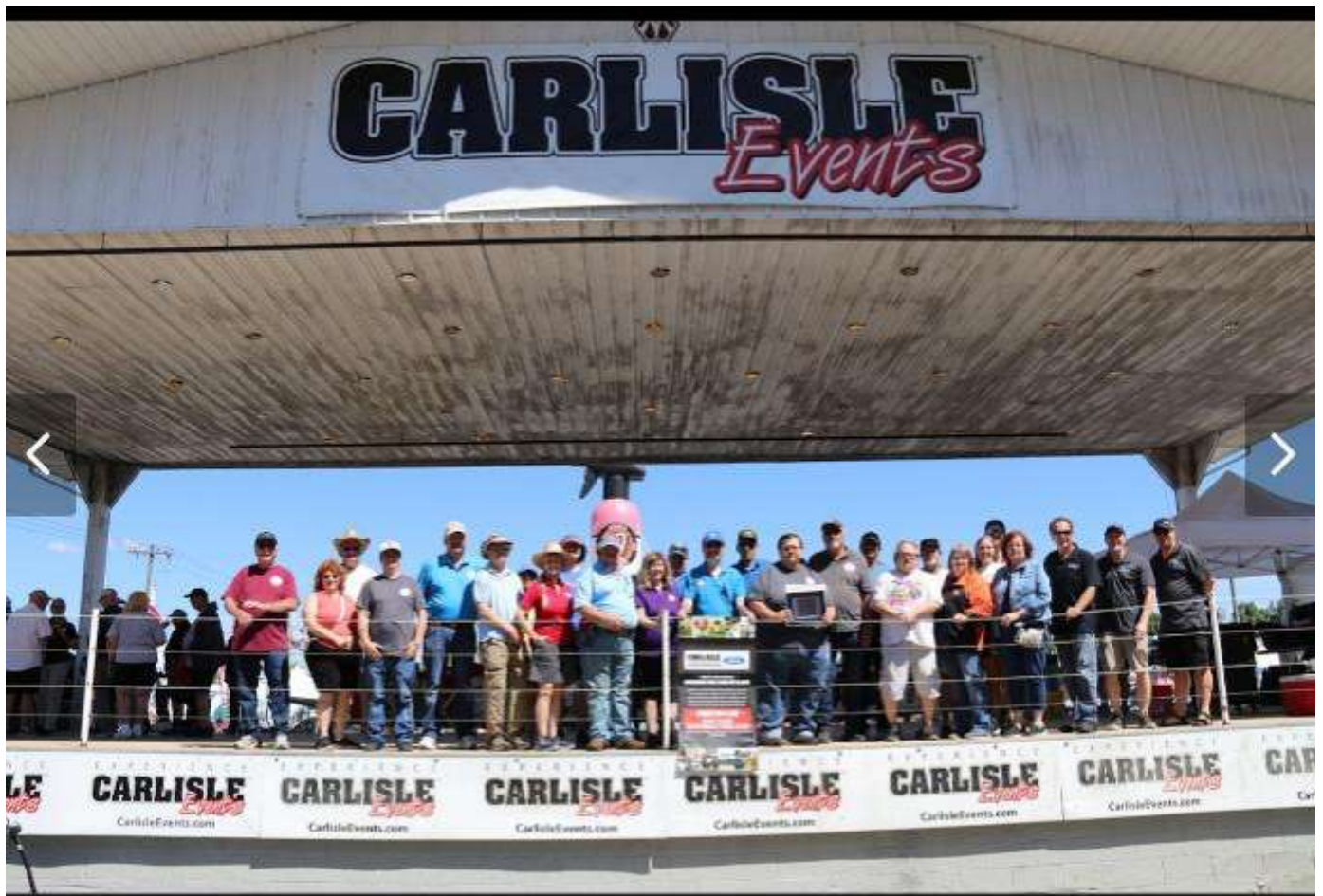
Picture Features The First State Mustang And Ford Club